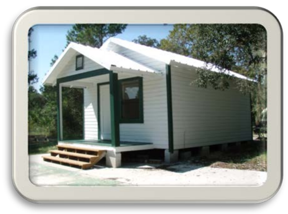
.....or don't rough it......