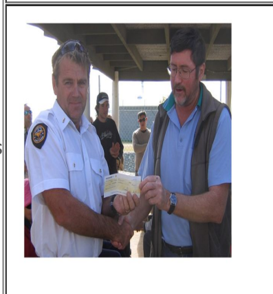
Presentation of a cheque for $200 to the Redcliffe Coastguard on behalf of the BISFC and all who fished the event.